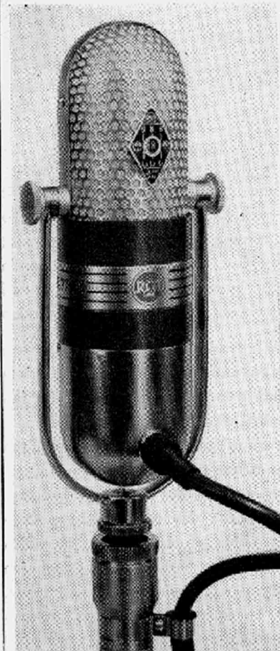
Rear view of 77-DX Microphone